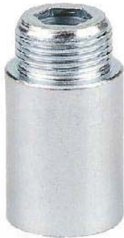
FIG. UNI 529/A