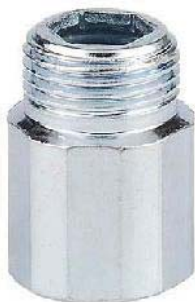
FIG. UNI 529 /A