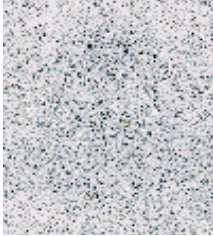
FIG. UNI 529/A

PROLUNGA PESANTE - M.F. M.F. HEAVY SOCKET-ROUND MODEL Filettature-Threads UNI ISO 228